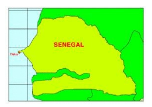
CAYAR OFFSHORE PROFOND